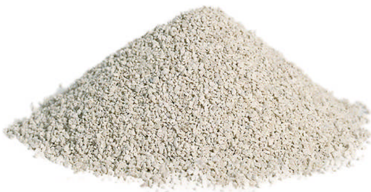
Juraperle pH correction media.

To treat waters that are otherwise clean and pure, a basic manual (up-flow) is all that is required. For water with Iron, Manganese or turbidity problems, an automatic backwashing downflow system will be needed to remove accumulated debris.