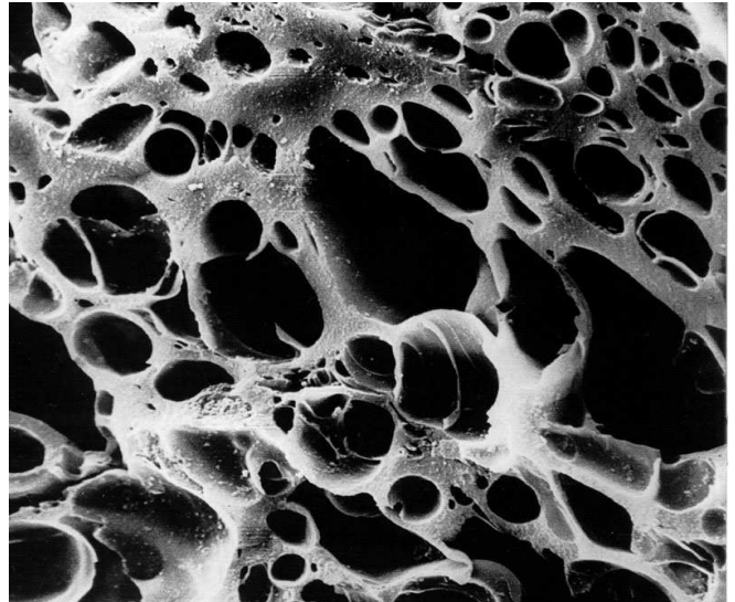
Carbon media under the microscope