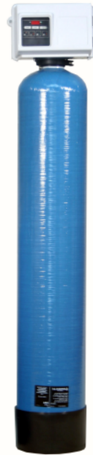
Carbon filter with a Fleck 2510 valve

Silver impregnated: the Silver acts as a biocide, preventing microbial growth